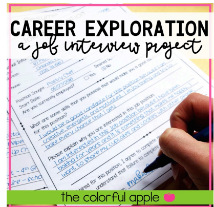
Career Exploration a job interview project

Thank you to the artists who created the design features in this product!