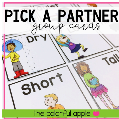
Pick a Partner Cards 100+ pairs!