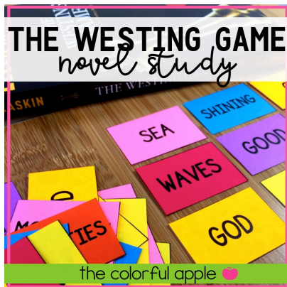
The Westing Game a novel study